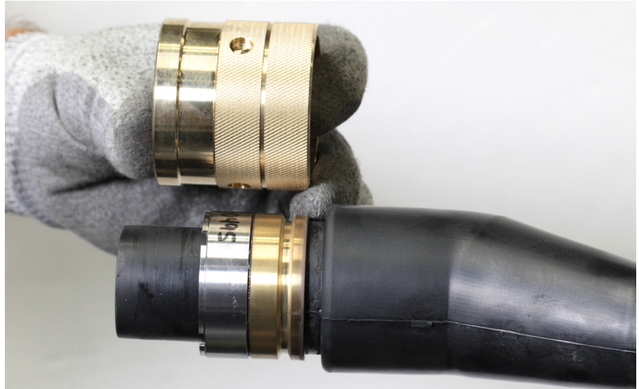
The surface connector's bronze coupling ring (shown above) has been removed to show the bronze connector body and the Removable Sealing Element (steel color)

The face of the surface connector can be easily inspected to ensure that it is clean, dry, and free of damage or distorted sealing cones. Should the connector face exhibit damage or distortion, then it will not be re-used. The seal that keeps moisture out of the connector interface is located under the coupling ring. This seal can be difficult to inspect.